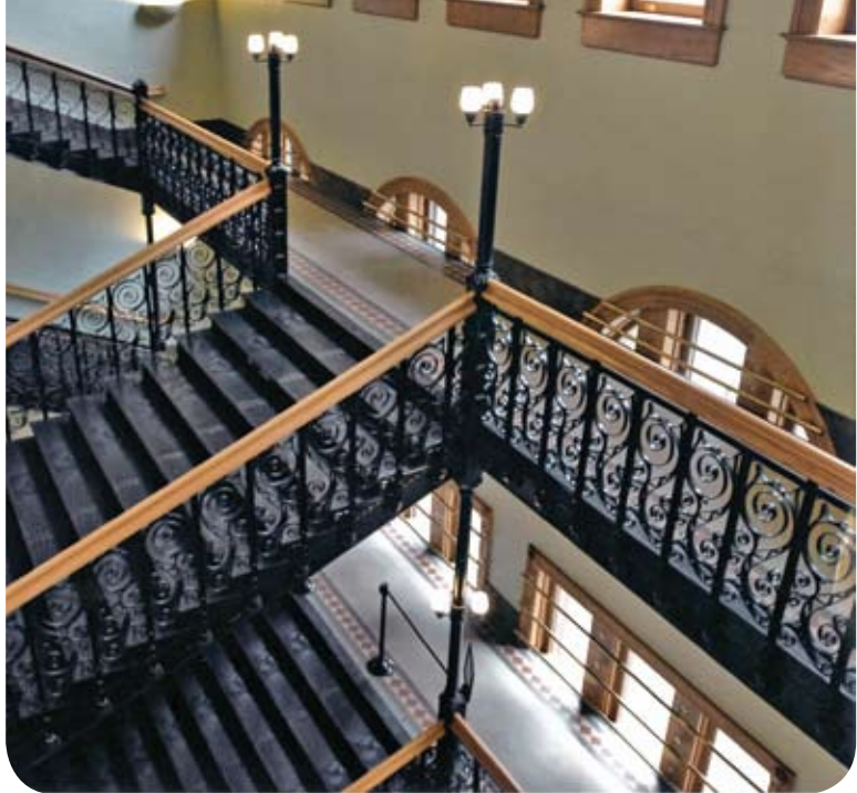
Dallas County Courthouse

Where the Williamson County Courthouse sees tourism cross-promotions because of its relationship to area museums, other courthouses experience this benefit from the presence of a museum being contained within its own walls. The increased visitation the Denton County Courthouse-on-the-Square has received reflects this partnership. Since 2003, the visitation to the Courthouse-on-the-Square Museum and other area government facilities has increased from 41,428 visitors to 84,849 in 2007.