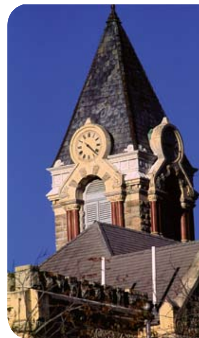
Fayette County Courthouse

Denton has also seen a rise in funds collected from the hotel occupancy tax (HOT), which further illustrates an increase in visitation. There was a 23 percent increase in HOT funds collected in 2007 from 2006, and from October 2007–December 2008 the city generated $1.3 million in revenue from the HOT.