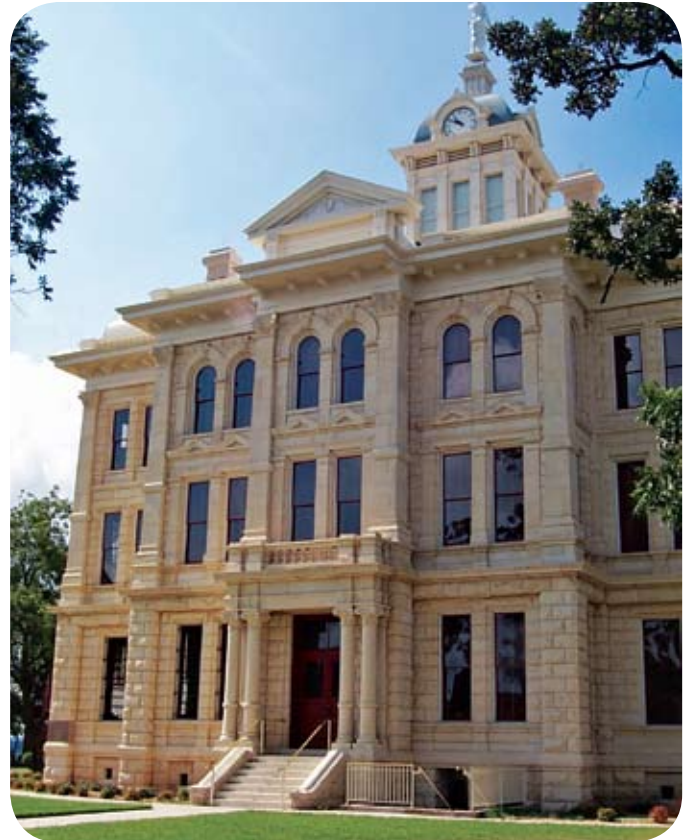
Milam County Courthouse