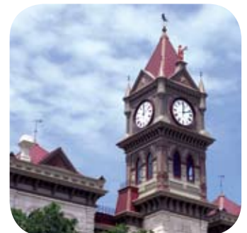
The 1886 Bosque County Courthouse in Meridian originally had a Gothic tower and small turrets which were dismantled in 1935 and rebuilt in 2007 during the restoration.