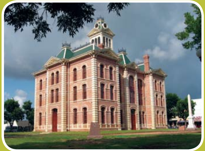
The project is considered one of the most dramatic restorations in the program.