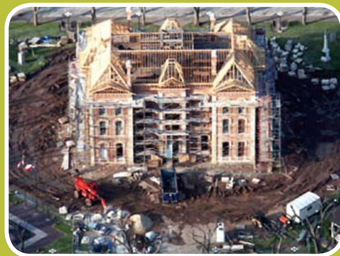
The restoration included the demolition of the 1940s additions and replicating the pressed metal shingle roof and clock tower.

The THC recently consulted representatives from Bee, Harrison, Presidio and Wharton counties about the impact of the Texas Historic Courthouse Preservation Program on their communities. The overwhelming consensus was their courthouse restorations played a crucial role in the resurrection of their downtowns and often acted as the primary impetus for economic renewal of the business districts adjacent to the historic courthouse square.