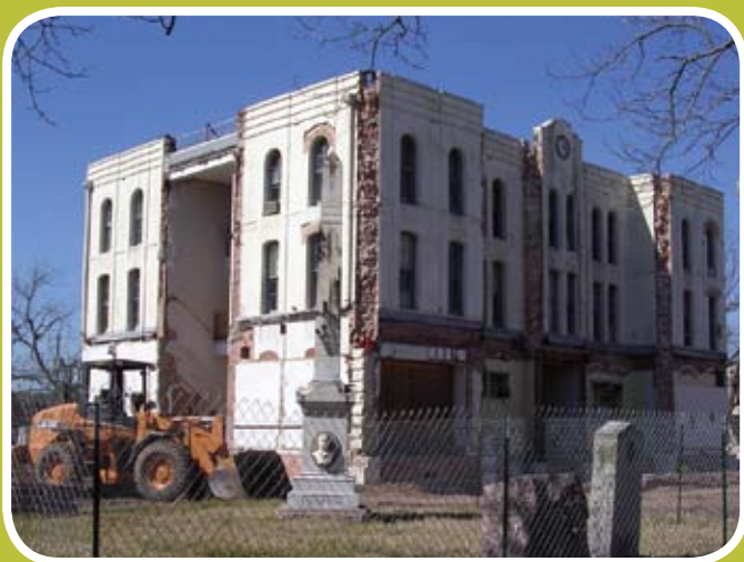
A stucco exterior, added in 1935, is removed from the 1889 Wharton County Courthouse.