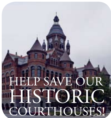
Dallas County Courthouse

PRESORTED STANDARD U.S. POSTAGE PAID AUSTIN, TX PERMIT NO. 1938