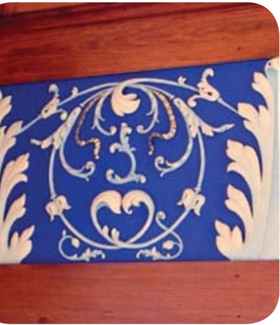
Harrison County Courthouse